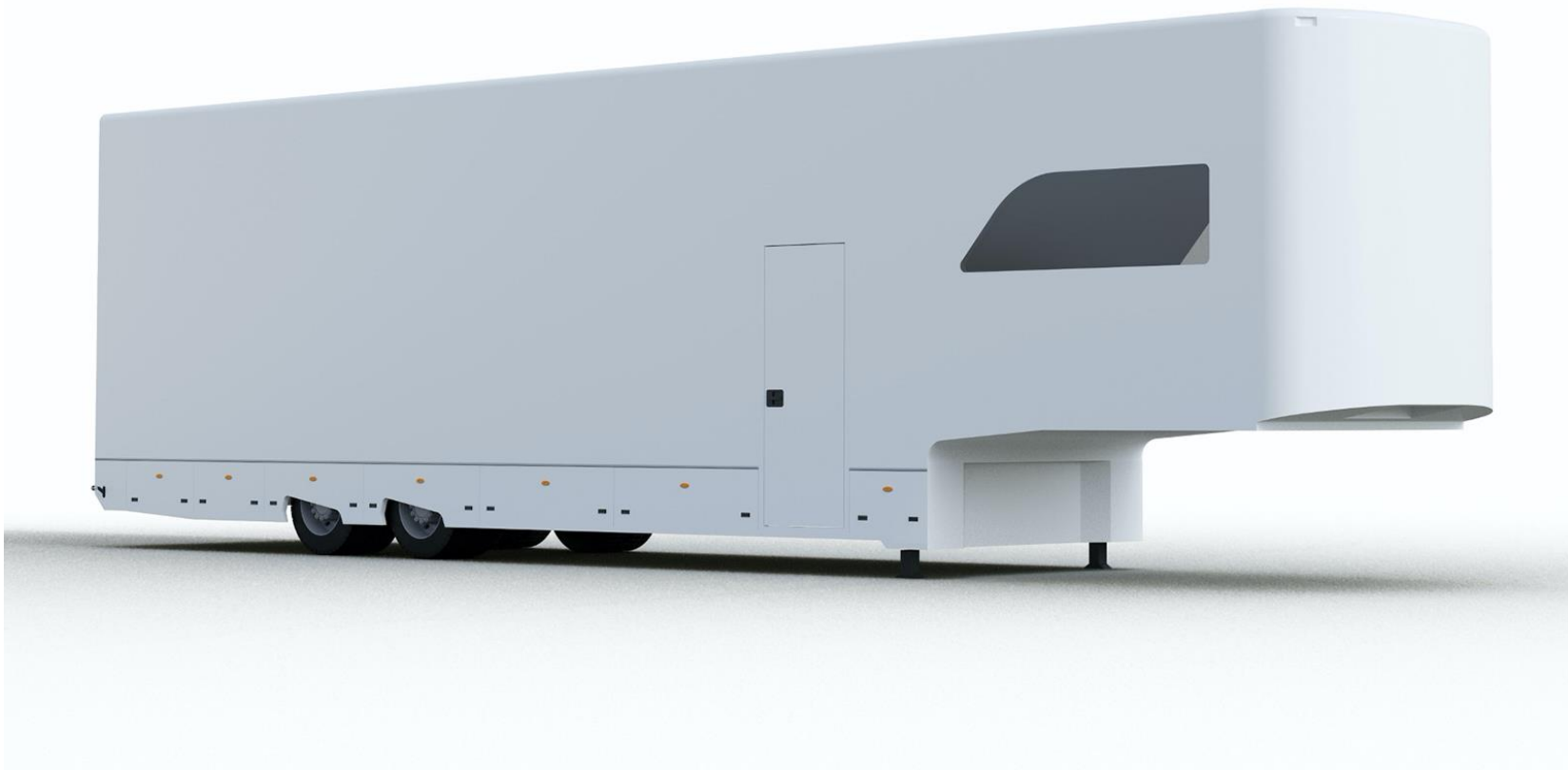
ASTA CAR Z2