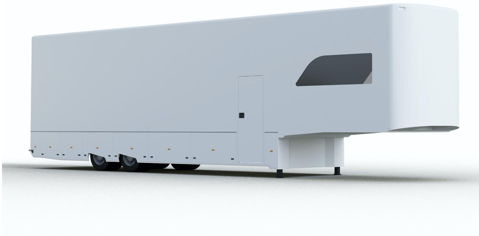
ASTA CAR Z1