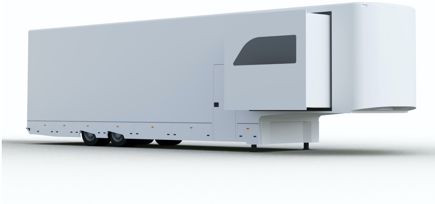
ASTA CAR Z2 SLIDE